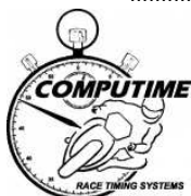
Clerk of Course - Chris Peake