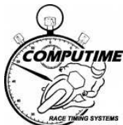
Clerk of Course - Chris Peake